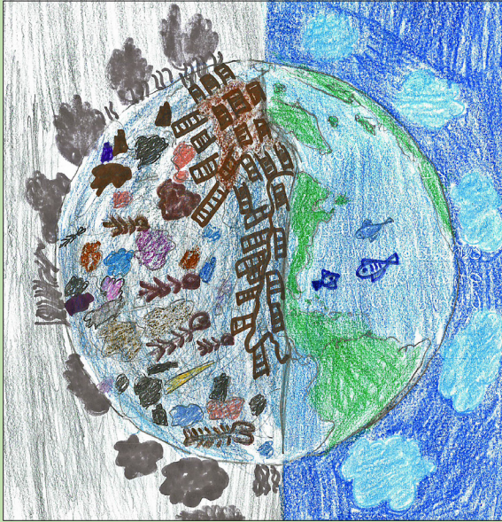
AANYA C., 6, KOWLOON TONG, HONG KONG

What will Earth look like in 30 years? We asked kids to draw an answer to that question. Here are a few of their drawings. What do you see?