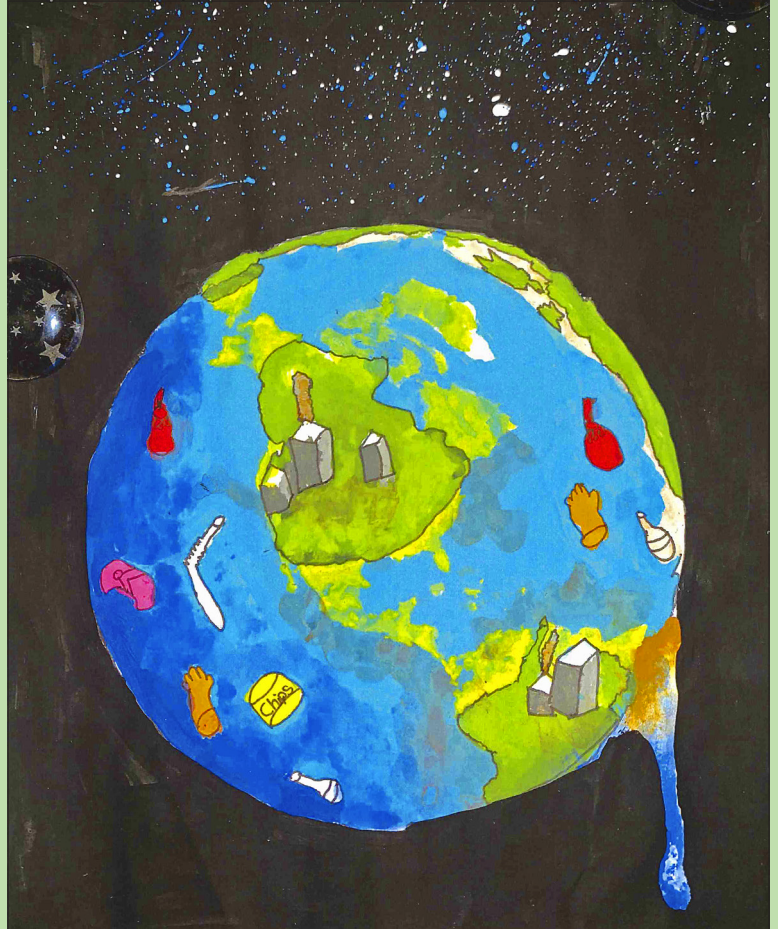
ALEXANDRA A., 9, MIAMI, FLORIDA